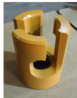
3 J HOOK